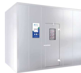
Walkin Stability Chamber