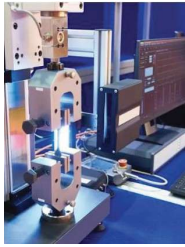
Test & Analytical