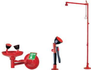
SAFETY SHOWER & EYEWASH